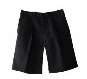
Knee length black shorts