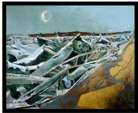
Totes Meer By Paul Nash