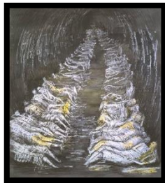
Tube Shelter By Henry Moore