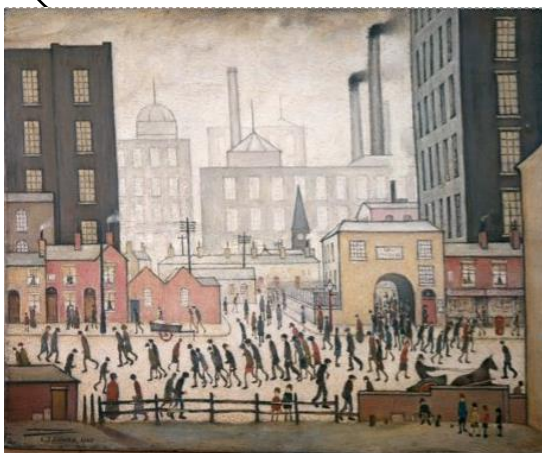
'Coming from the Mill' - by Lowry