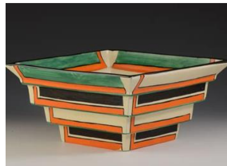
Clarice Cliff ceramic designs