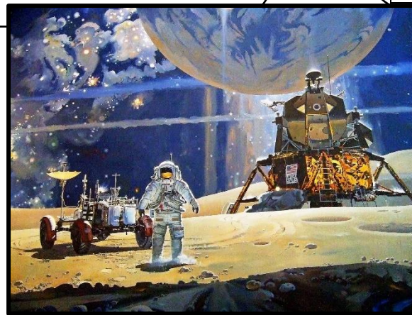
The Space Mural, 1976