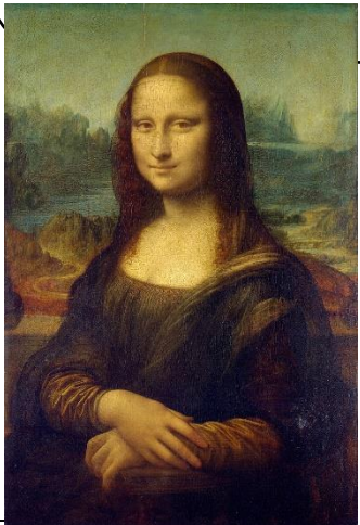
The Mona Lisa, c.1503