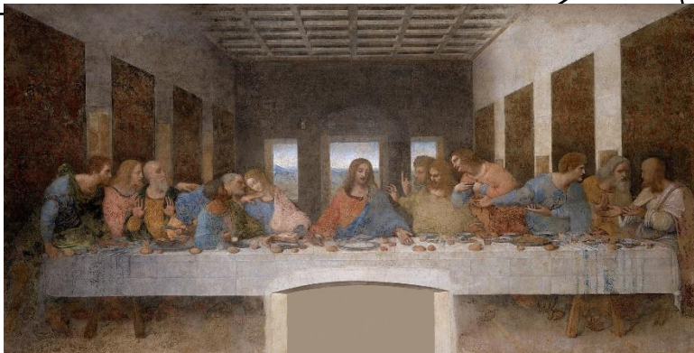
The Last Supper, c.1495