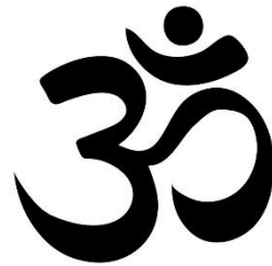
Aum – the Hindu symbol