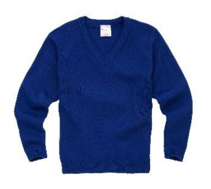
Royal blue v neck jumper/cardigan