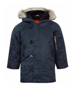
Warm winter coat (any colour)