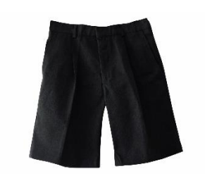
Knee length black shorts