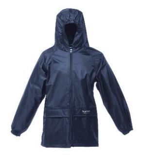
Waterproof jacket (any colour) all year round