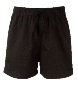
Plain black shorts (small sports logo acceptable, no patterns)