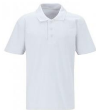
White polo t-shirt