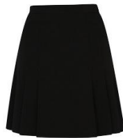
Knee length black skirt/pinafore