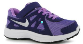
Sensible trainers, appropriate for sport (any colour)