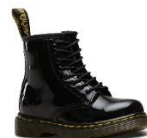
Plain black boots patent or matte