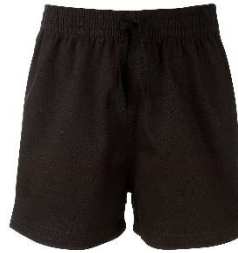
Plain black shorts (small sports logo acceptable, no patterns)