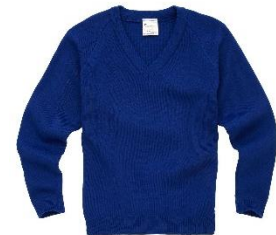
Royal blue v neck jumper/cardigan