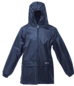
Waterproof jacket (any colour) all year round