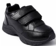
Plain black shoes