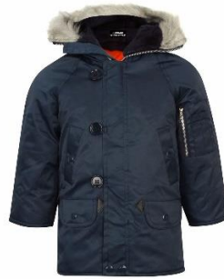
Warm winter coat (any colour)