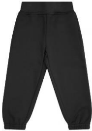
Plain black jogging trousers (small sports logo acceptable, no patterns)