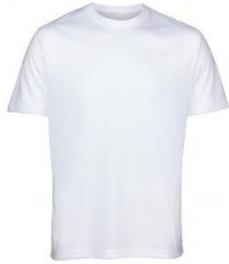
Plain white round neck t-shirt (no logos or patterns)