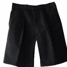
Knee length black shorts