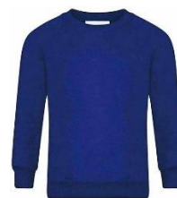
Royal blue round neck jumper