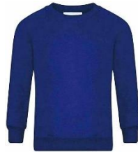
Royal blue round neck jumper

No hoodies No football tops No coloured tops