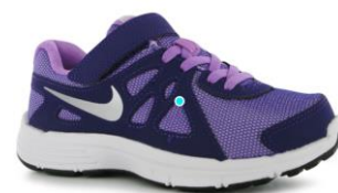
Sensible trainers, appropriate for sport (any colour)