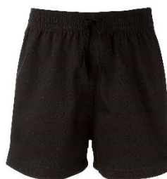
Plain black shorts (small sports logo acceptable, no patterns)